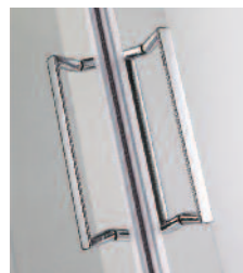
SLEEK POLISHED CHROME HANDLES