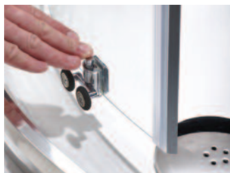
QUICK RELEASE DOUBLE ROLLERS