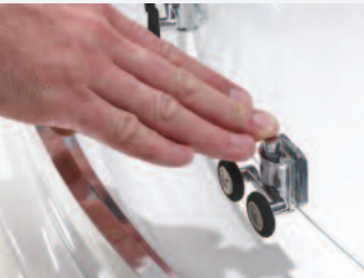
QUICK RELEASE DOUBLE ROLLERS