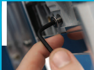
TWIST - ADJUST TO SUIT