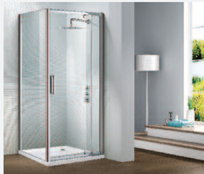
PIVOT DOOR WITH SIDE PANEL