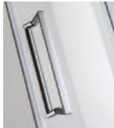
SLEEK POLISHED CHROME HANDLES

Suitable for installation with a side panel - See page 59.