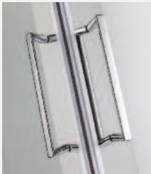
SLEEK POLISHED CHROME HANDLES