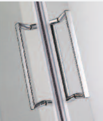
SLEEK POLISHED CHROME HANDLES