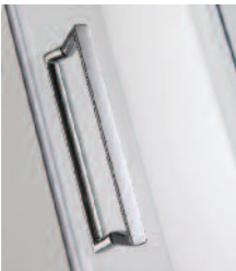
SLEEK POLISHED CHROME HANDLES

Suitable for installation with a side panel - See page 59.