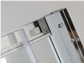
SOFT SILICONE WHEEL TRACK