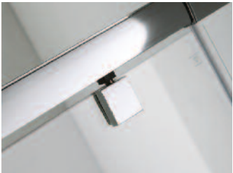
MINIMALIST CHROME PROFILES AND PIVOT HINGE